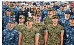
Midshipmen sing service songs at the Salute to Service game

It is well known that KU has consistently ranked as one of the top schools for veterans, and the Salute to Service game is one of the ways KU recognizes military service. The ROTC branches always enjoy partaking in the activities to help pay tribute to the sacrifice of those that have gone before us. While the football team struggled this year, we still found enjoyment in interacting with the community, and representing the Navy and Marine Corps team within the Lawrence community.